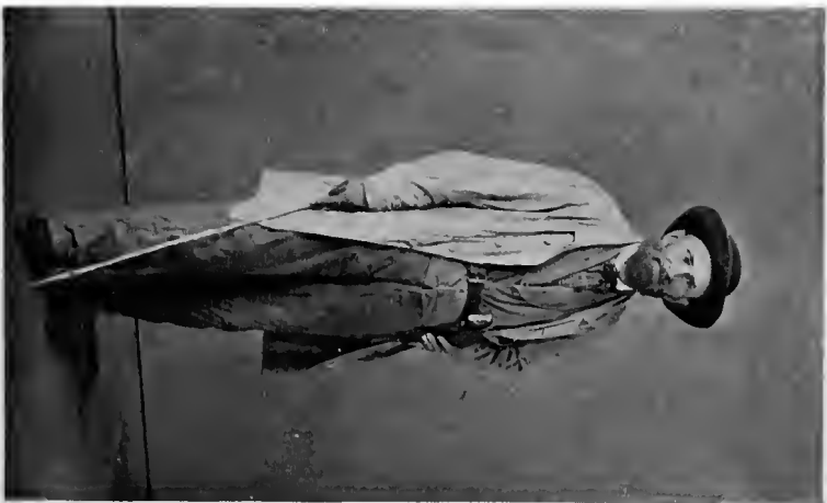
GENERAL EARLY, DISGUISED AS A FARMER, WHILE ESCAPING TO MEXICO, 1865